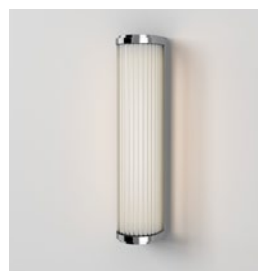
CODE: 1380013 (8556) FINISH: POLISHED CHROME