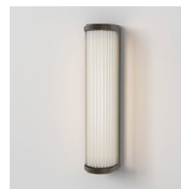
CODE: 1380014 (8544) FINISH: BRONZE

TO MAINTAIN THIS PRODUCT TO ITS BEST CONDITION, PLEASE VIEW OUR CARE AND CLEANING GUIDE ON THE SUPPORT SECTION OF THE ASTRO WEBSITE.