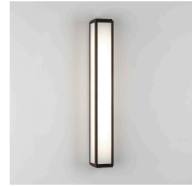
CODE: 1121058 (8291) FINISH: BRONZE

THIS PRODUCT IS SUITABLE FOR ONEROUS ENVIRONMENTS AND CAN BE INSTALLED WITHIN FIVE MILES OF THE COAST - THREE YEAR WARRANTY APPLIES.