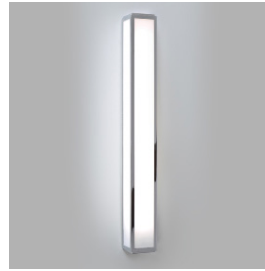
CODE: 1121020 (7134) FINISH: POLISHED CHROME