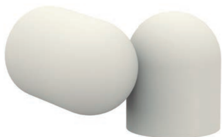
7295 Negro-Black 1L x GU10 (no incl.)