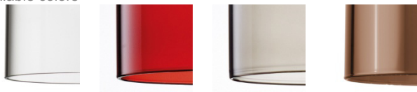
CS Crystal RS Red GR Grey BR Metallic bronze

12V - EELc (Energy Efficiency Label compatibility): C , B G4L - EELc (Energy Efficiency Label compatibility): A, A+ , A++ The energy class letter in bold format is related to the bulb supplied together with the specific article