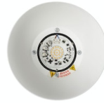
RF0090300 Sink/chip led/reflector assembly Aim