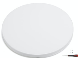
RF1570200 Kit diffuser