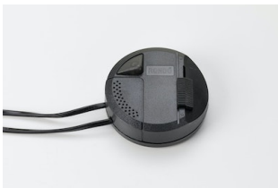
RF28045 Led rondo' dimmer 220/240v 40- 250w 4-100w