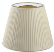
F6278007 Ktribe Floor/Table 2 fabric diffuser assembly