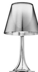
Table lamp providing diffused light. Fully transparent, injection-molded PMMA polymethylmethacrylate frame; opaline, injection-molded polycarbonate internal diffuser and injectionmolded transparent or colored polycarbonate external diffuser completely finished with high-vacuum aluminization process.

Are you a professional and your project needs consulting and support?