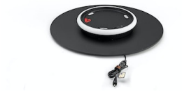
F0261030A Small base