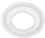
RF03206 T1 cover ring