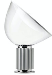
Table lamp providing indirect and reflected light. Reflector in painted aluminium, gloss white on the outside and matt white on the inside. Directionable diffuser in transparent mouth-blown glass. Body in matt black. silver anodized or bronze anodized aluminium. Base in nickel-plated metal. Electric cable of useful length 220 cm, with dimmer switch for ON/OFF and adjustment of the light flow between 10-100%. Plug-in power supply with interchangeable plugs.

Are you a professional and your project needs consulting and support?