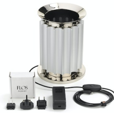
F6608004 Anodized silver base