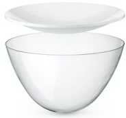
F6510000 Taccia transparent diffuser & reflector