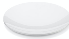
RF00780 White reflector