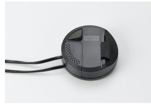
RF28045 Led rondo' dimmer 220/240v 40- 250w 4-100w