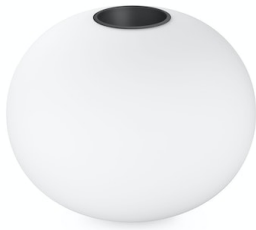
F3055031 Glo-Ball 2 opal diffuser. Black Base