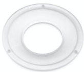
RF03203 Romeo T1 cover ring